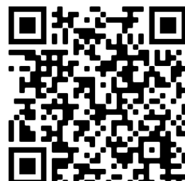
Pop Up Shop